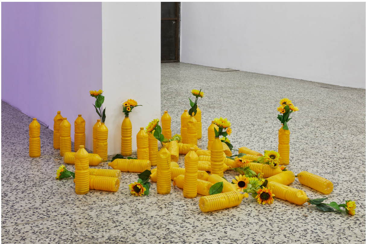
Exhibition views Shout, Sister, Shout! La Rose, Marseille, France 2021