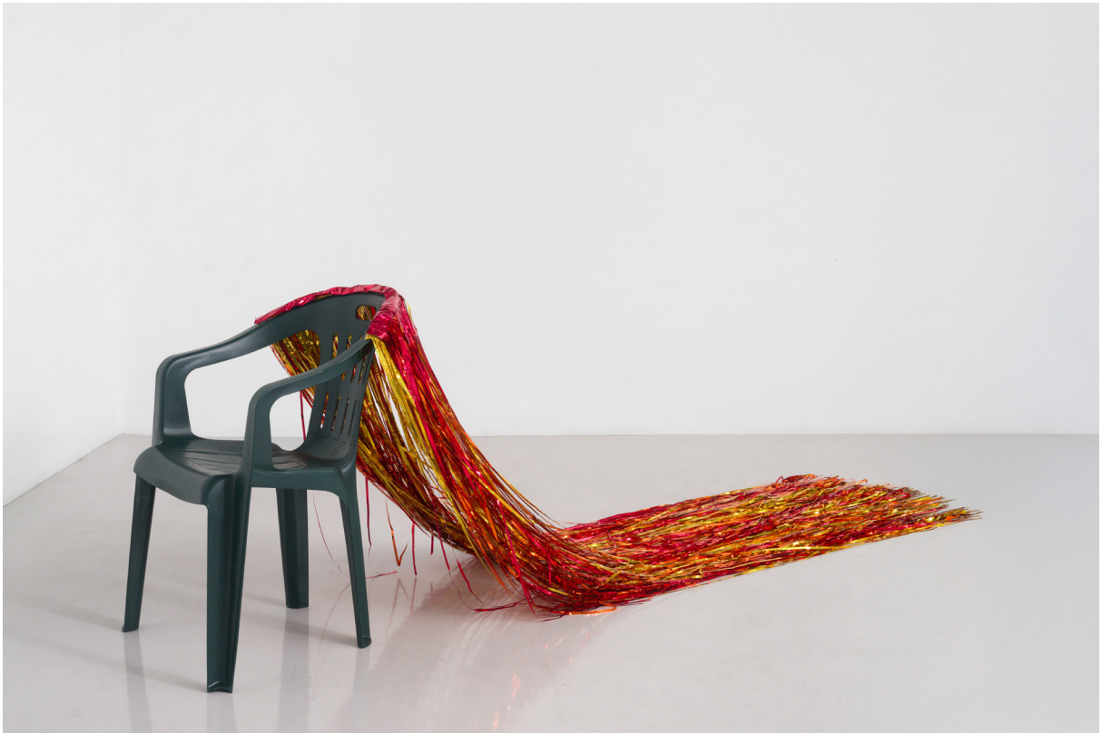
Les comètes 1 2025 Plastic chair, glitter tinsel foil 80 x 55 x 120 cm Unique