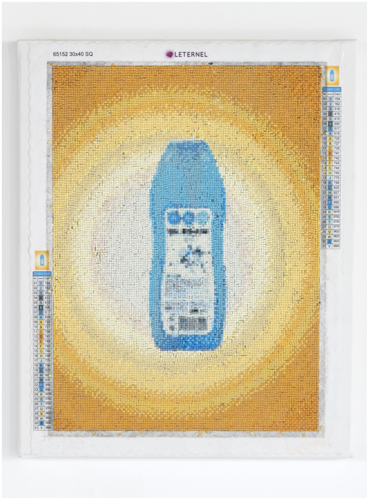
Tous les jours, gel douche sport 2023 Diamond painting, on frame, kitchen stain 46 x 38 cm Unique