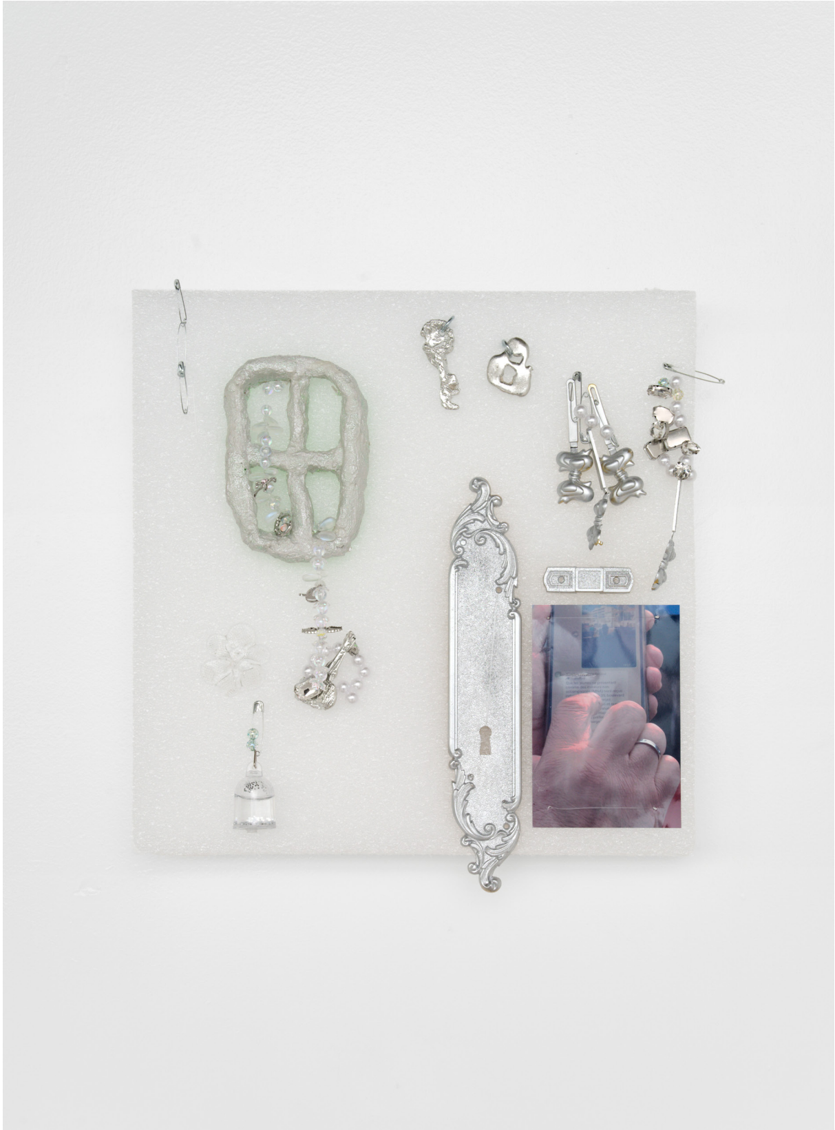
Arc 3/10 Sous une pluie de poussière, qui tombe au ralenti 2025

Polyethylene foam, fishing wire, stickers, photographs, hook, stolen keyring, slime, pearls and charms, tin object, keyhole, safety pins, hairclips