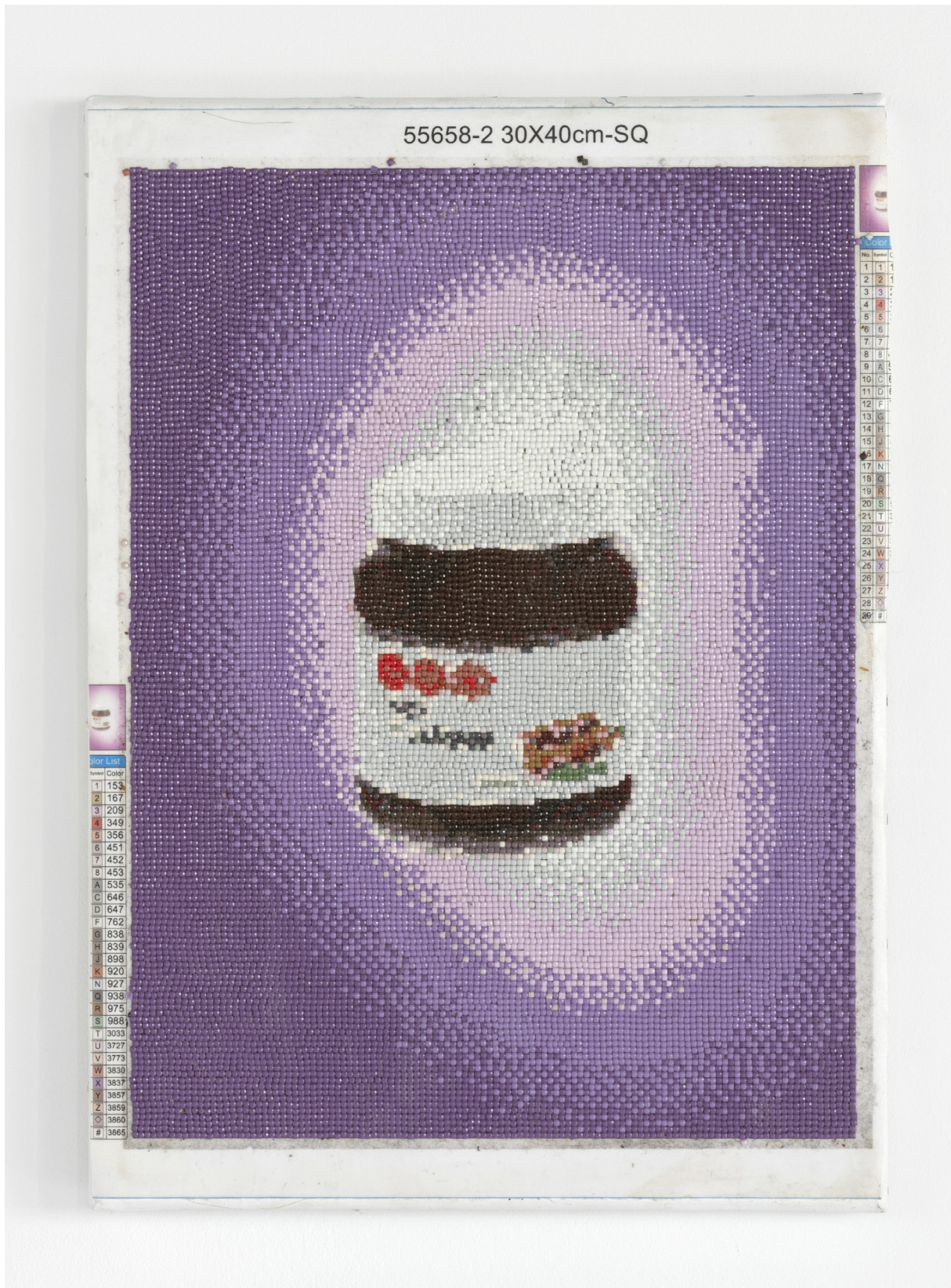
Tous les jours, pâte à tartiner 2023 Diamond painting, on frame, kitchen stain 46 x 33 cm Unique