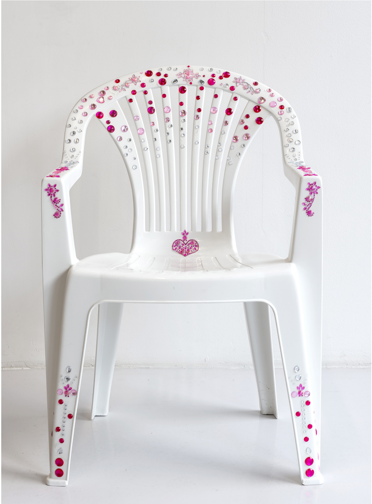
Untitled 2018-2022 Plastic chair, strasses and sequins Variable dimensions Unique