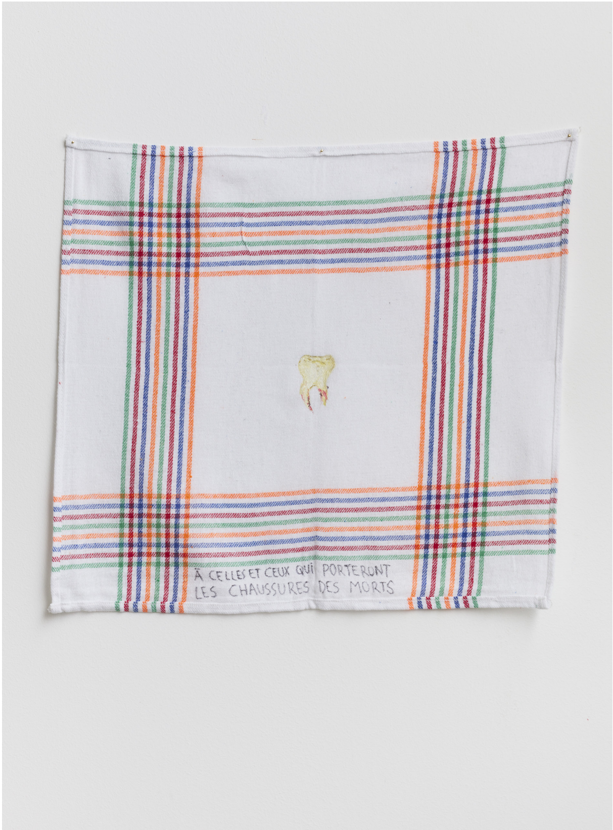
Pour celles, à celles et ceux qui porteront les chaussures des morts 2023 Acrylic paint on cloth 53 x 54 cm Unique