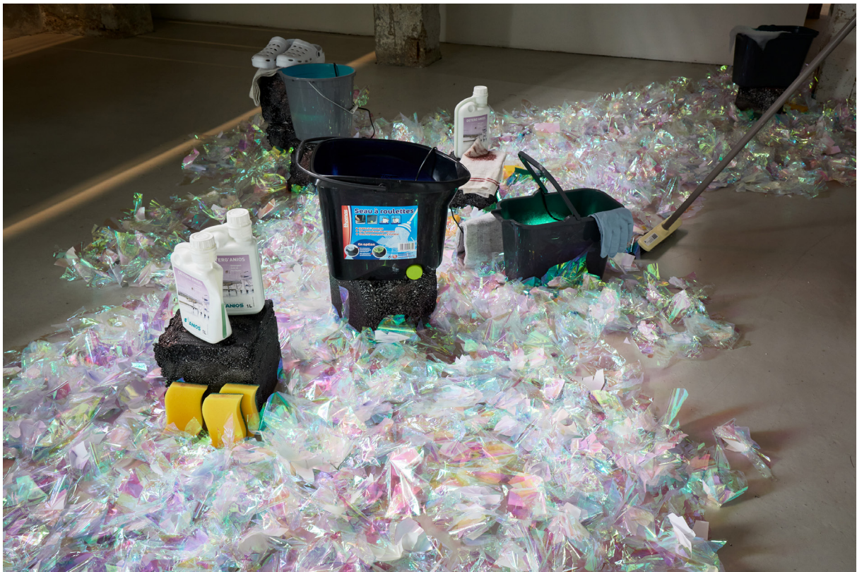
À nos deter' 2020

Fountain, detergent smell, iridescent paper flowers, buckets, brooms, work shoes, sponges, mops, blue and purple gelatin filters, glitter, polystyrene.