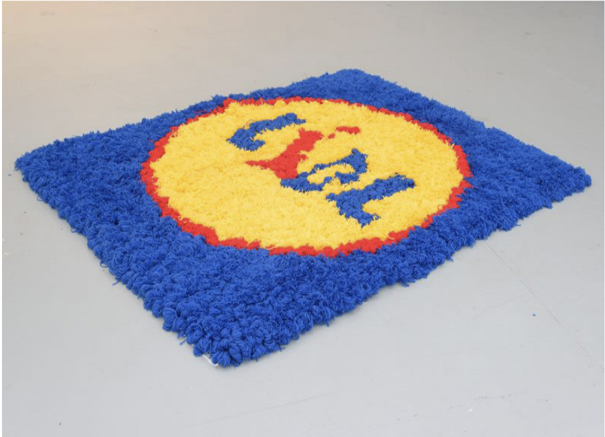
L'Odyssée de Pénélope 2018-2020 600 hours in 2018, one minimum wage, wool carpet 200 x 180 cm Unique