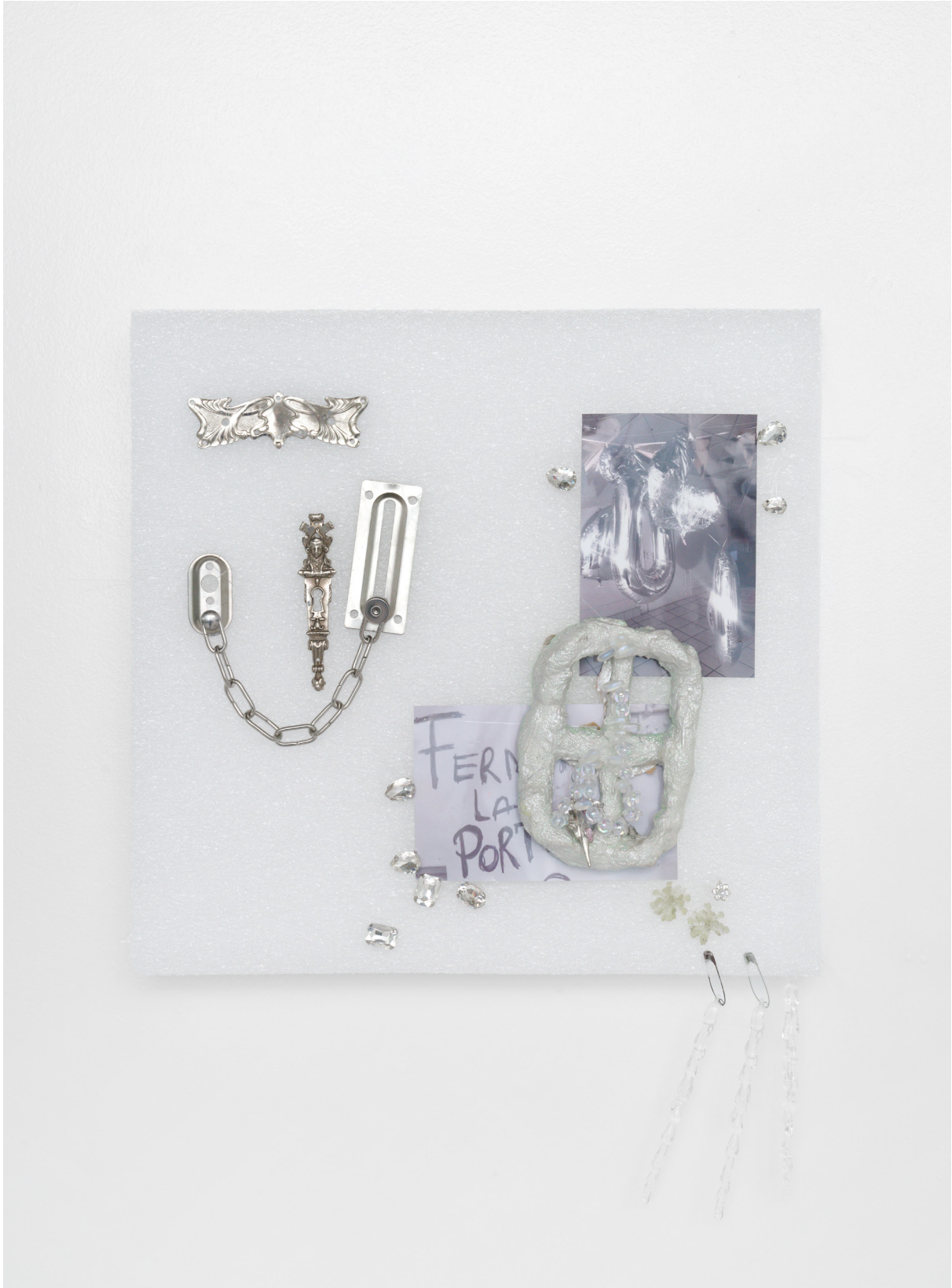
Arc 4/10 Fermez-là, fermez-là bien franchement, sans personne à l'extérieur. 2025

Polyethylene foam, fishing wire, stickers, photographs, keyring, slime, pearls, charms, keyhole, tin object, safety pins, hairclips, door chain lock, tracing paper, plastic 38,5 x 38,5 x 5 cm Unique