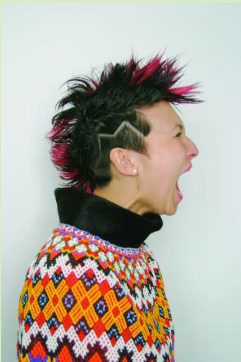
SELF-PORTRAIT, (2004)

is a Danish writer and film-maker. He is currently based in the capital of Greenland, Nuuk (his hometown), where he is making a documentary on contemporary artists and culture.