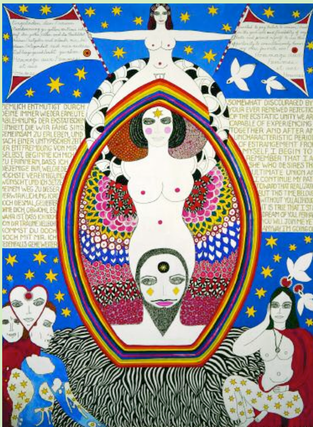
DOROTHY IANNONE "HOMMAGE AUX FEMMES ET AUX HOMMES" 1983, FRAMED ACRYLIC PAINT ON WOOD, 160 X 120 CM © AIR DE PARIS, PARIS AND ESTHER SCHIPPER, BERLIN