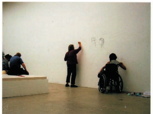
Rirkrit Tiravanija's Secession , page 26