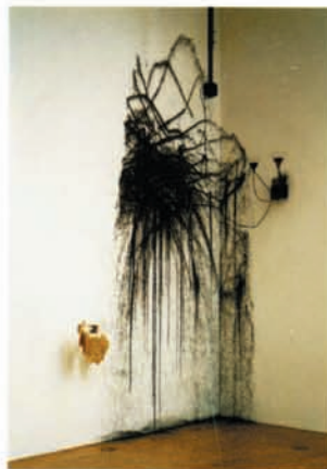
Rebecca Horn's Floating Souls and Les Amants , page 70