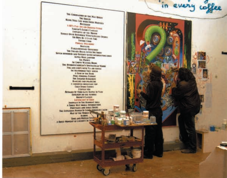
Keith Tyson's Locked Out of Eden , page 70