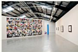
Installation view of "Allen Ruppersberg: You and Me or The Art of Give and Take," 2009 Santa Monica Museum of Art