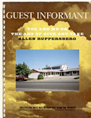
Catalogue for Allen Ruppersberg's "You and Me or The Art of Give and Take"

Drohojowska-Philp, Hunter. "Ruppersberg Time." arnet Magazine , 6 October 2009, http://www.artnet.com/magazineus/features/drohojowska-philp/allen-ruppersberg10-02-09.asp .