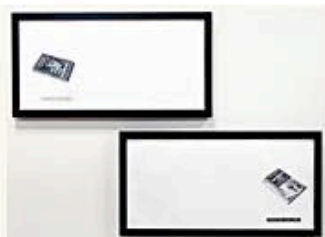
Allen Ruppersberg Twins 1989 Courtesy of Mike Kelley Photo by Bruce Morr