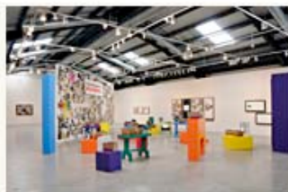
Installation view of "Allen Ruppersberg: You and Me or The Art of Give and Take," 2009 Santa Monica Museum of Art