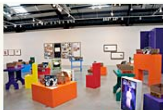
Installation view of "Allen Ruppersberg: You and Me or The Art of Give and Take," 2009 Santa Monica Museum of Art