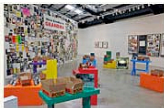
Allen Ruppersberg The Never Ending Book Part Two/Ar and Therefore Ourselves 2009