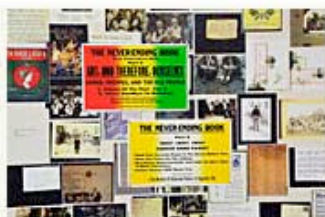
Allen Ruppersberg The Never Ending Book Part Two/Ar and Therefore Ourselves (detail) 2009