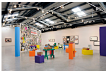
Installation view of "Allen Ruppertsberg: You and Me or The Art of Give and Take," 2009 Santa Monica Museum of Art