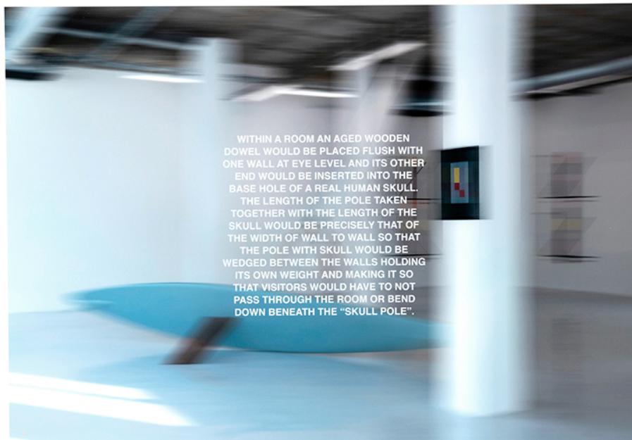
Noah BARKER & Liam GILLICK And Heaven Too (B), 2025 inkjet pigment print on Epson Premium Glossy RC 250 gr., framed papier 50 x 60 cm ; images 32 x 47 cm 51 x 61 cm 1/4 2 AP