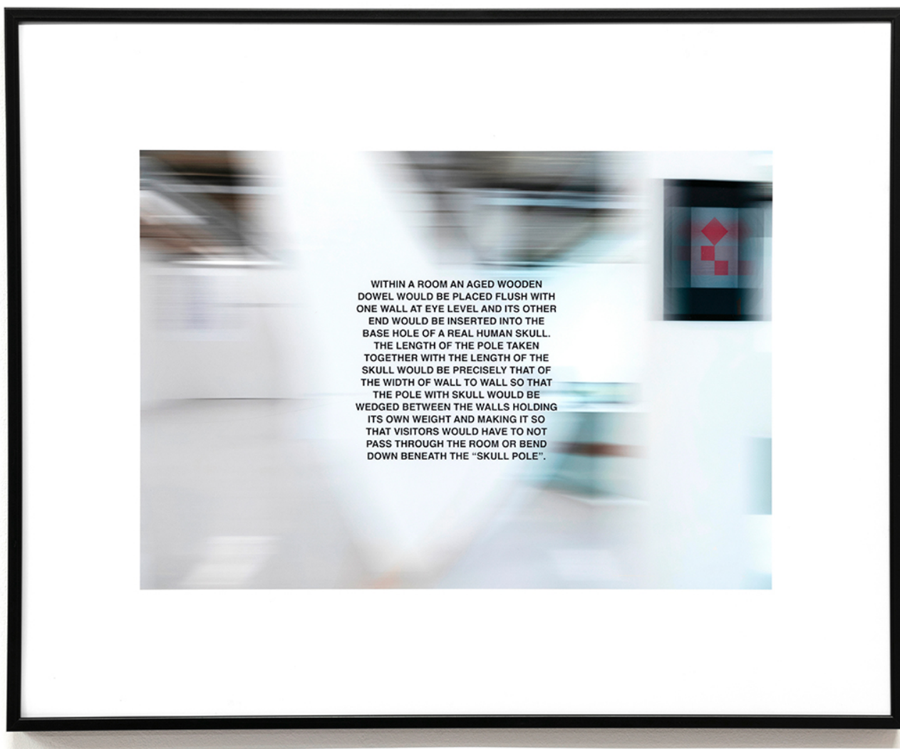
Noah BARKER & Liam GILLICK And Heaven Too (D), 2025 inkjet pigment print on Epson Premium Glossy RC 250 gr., framed paper 50 x 60 cm ; images 32 x 47 cm 51 x 61 cm 1/4 2 AP