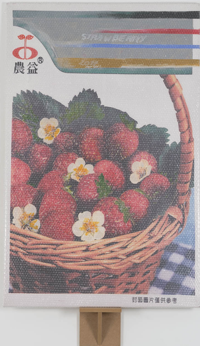
Jef GEYS Strawberry 2017, from Seed bag series, from Bubble paintings series, 2017 Oil on canvas, bullpack, mdf 160 x 92 x 12 cm (with wall stand) unique/-

As its title states, this work brings together two iconic series by Jef Geys: Seed bag series and Bubble paintings series. Jef Geys painted two seed packets a year, one large and one small, from 1962 till 2017. The works part of The Bubble painting series must remain in bubble forever. They can never be unwrapped. Geys painted red, blue and yellow paint marks on the edges of the packaging packing tape around the work, to guarantee the seal. These marks are a notary's version of painting.