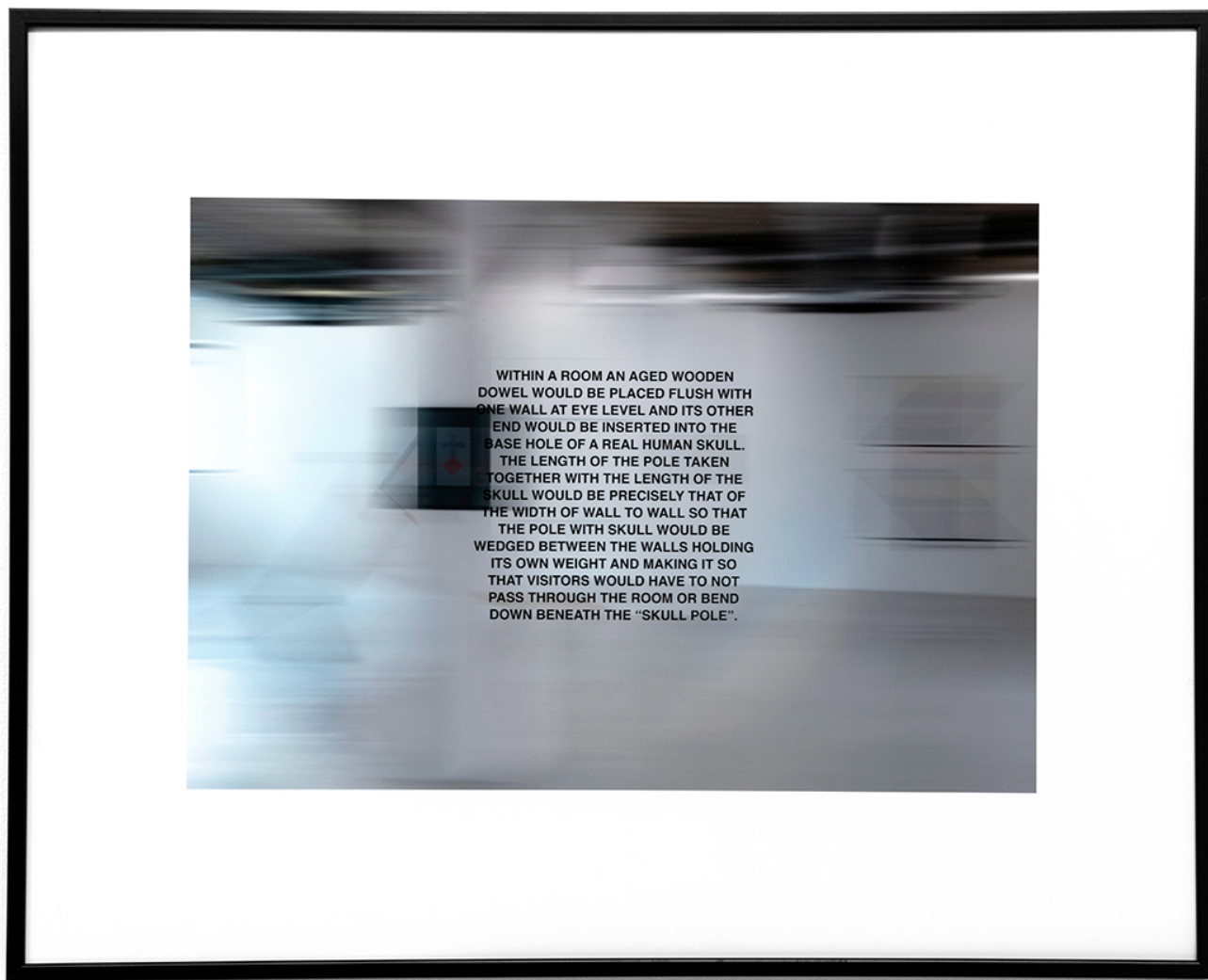
Noah BARKER & Liam GILLICK And Heaven Too (A), 2025 inkjet pigment print on Epson Premium Glossy RC 250 gr., framed 4 x (paper 50 x 60 cm ; images 32 x 47 cm) 51 x 61 cm 1/4 2 AP